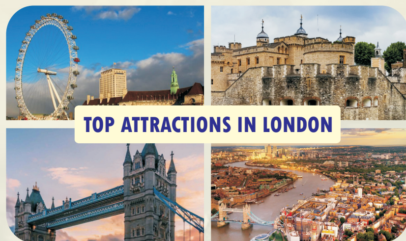
TOP ATTRACTIONS IN LONDON

London, the capital of England and the United Kingdom, is a 21st century city with history stretching back to Roman times. At its centre stand the imposing Houses of Parliament, the iconic 'Big Ben' clock tower and Westminster Abbey, site of British monarch coronations. Across the Thames River, the London Eye observation wheel provides panoramic views of the South Bank cultural complex, and the entire city.